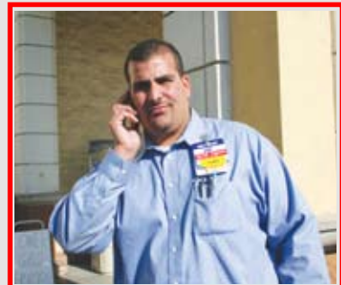
Wal-Mart manager calls for backup - "uhh,.. hello boss...."