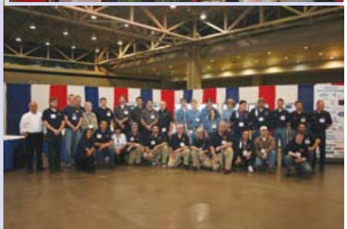
Maintenance Skills Participants