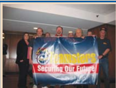
Chicago based UAL mechanics rally in support of IBT

The Teamsters' victory culminates a two-year effort by UAL mechanics and related personnel to gain strong representation. The bargaining unit consisted of 9,300 active and furloughed members eligible to vote in the election. Organizers attempted to reach each and every one of the furlougees. "We're thrilled that United's mechanics voted to join our union by such a large margin," said Teamsters General President Jim Hoffa. "United mechanics will now have the Teamsters' strength behind them in their fight against outsourcing to foreign repair stations. United has cut more maintenance positions than any other U.S. airline," Hoffa said, noting that United outsourced 45 percent of its aircraft maintenance expenses in 2006, three times the amount it outsourced in 1998. Hoffa also said the Teamsters would support the mechanics in their efforts to curb excessive executive compensation and restore their own retirement security.