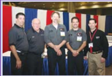
Local 562 AMT's place third at MSC

MSC will take place in Las Vegas, Nevada, during the Aviation Industry Expo, March 10-12, 2009.